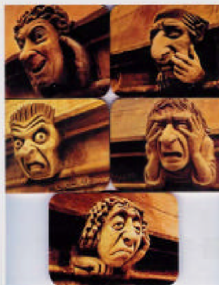
Figure 1: Oxford gargoyles

Think how often you have heard teachers talk about the pressures of continually having to deal with ‘the next new change to come along’.